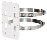
PFA152 Pole mount