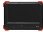
X41T Camera Tester